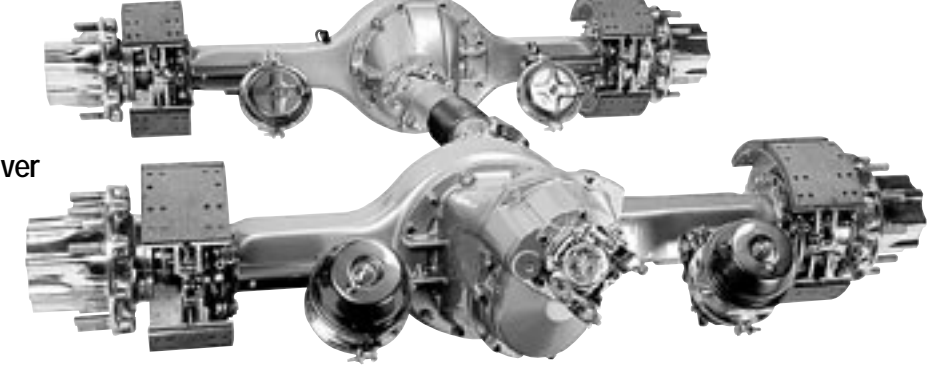
DS404(P) Single Reduction Tandem Axle